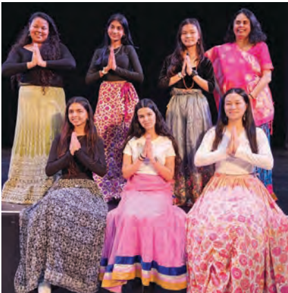
(Pictured): Diwali Week.