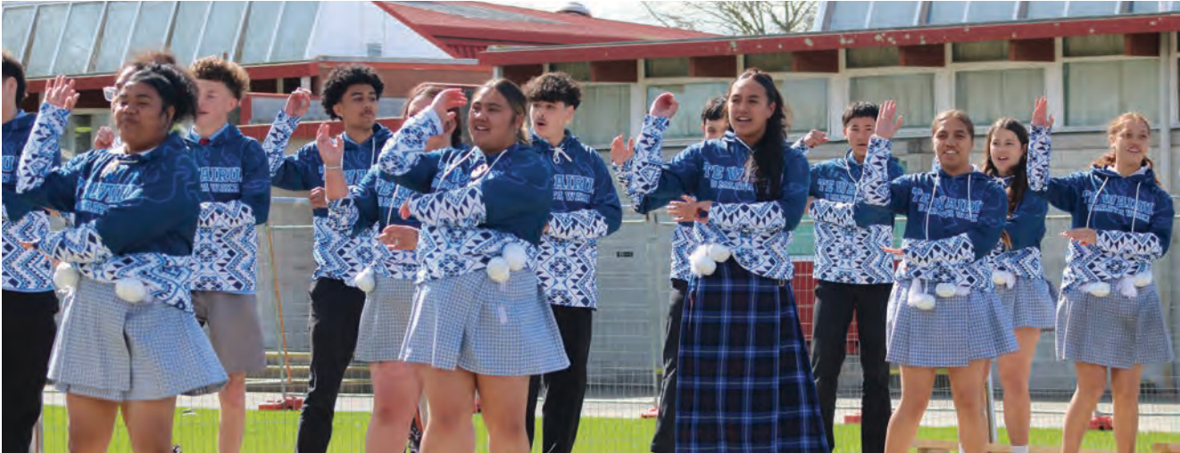
(Pictured): Students in cultural attire, with the Tongan flag centre stage.