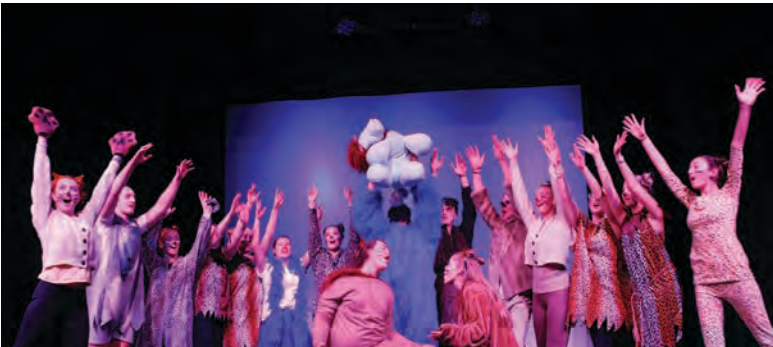
(Pictured above): Blue House performing 'Mash-up from The Lion King' to win the hotly contested House Fest. Haka girls performing their Waiata-a-ringā, Tūkaha.