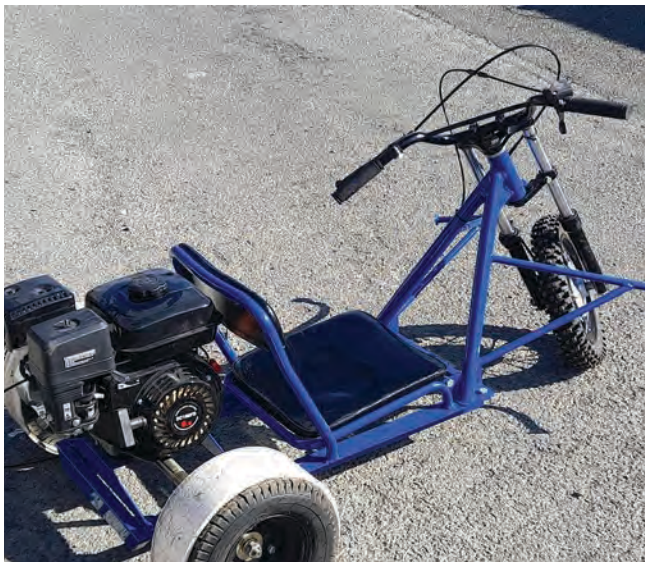
(Pictured): Connor Duffell's completed drift trike.

Students use Fusion360 to 3D-model the frame components, then profilecut these from 3mm steel, on the College's CNC Plasma Cutter. This ensures duplicate parts are identical as well as teaching a valuable skill.