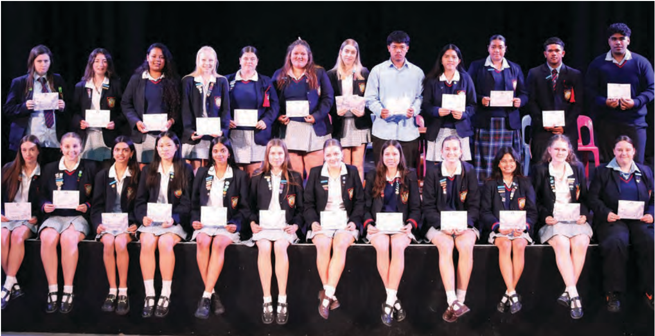
(Pictured): Year 13 Performance Award recipients.