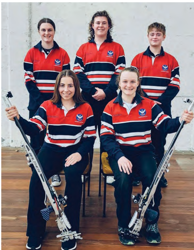
(Pictured): The Gold winning team for the NZSS Shooting (Triple S) Championships.

This match was held in Blenheim, marking the first time since Covid-19 that the match was restored to its original format of being a shoulder-to-shoulder match hosted by a single venue. It saw schools from both Islands compete to be crowned the champion. Ashburton College sent two very strong teams to this event with high hopes of success. After finishing 2nd overall in both Postal matches held during the season, it was the turn of Cambridge High to finish on top with a total score of 871.35, four points ahead of the Ashburton College Red team on 867.37. Ashburton College Gold finished in fourth on inners with a score of 864.29.