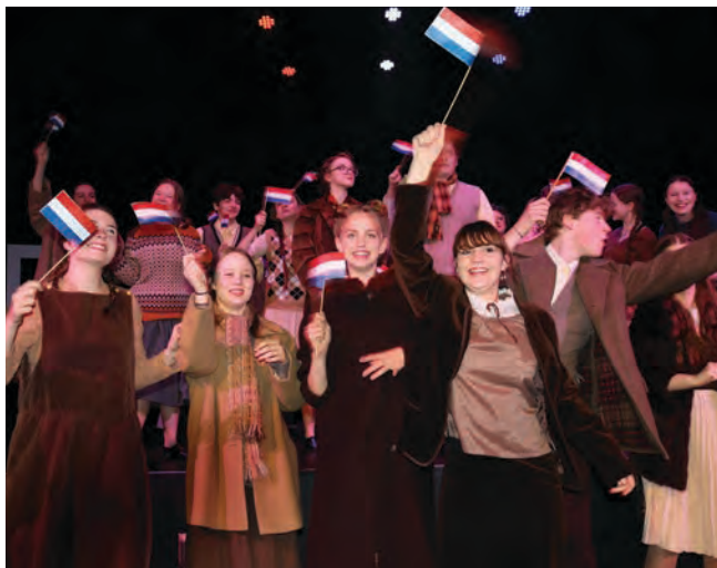
(Pictured above): The finale. Liberation Day in the Netherlands.