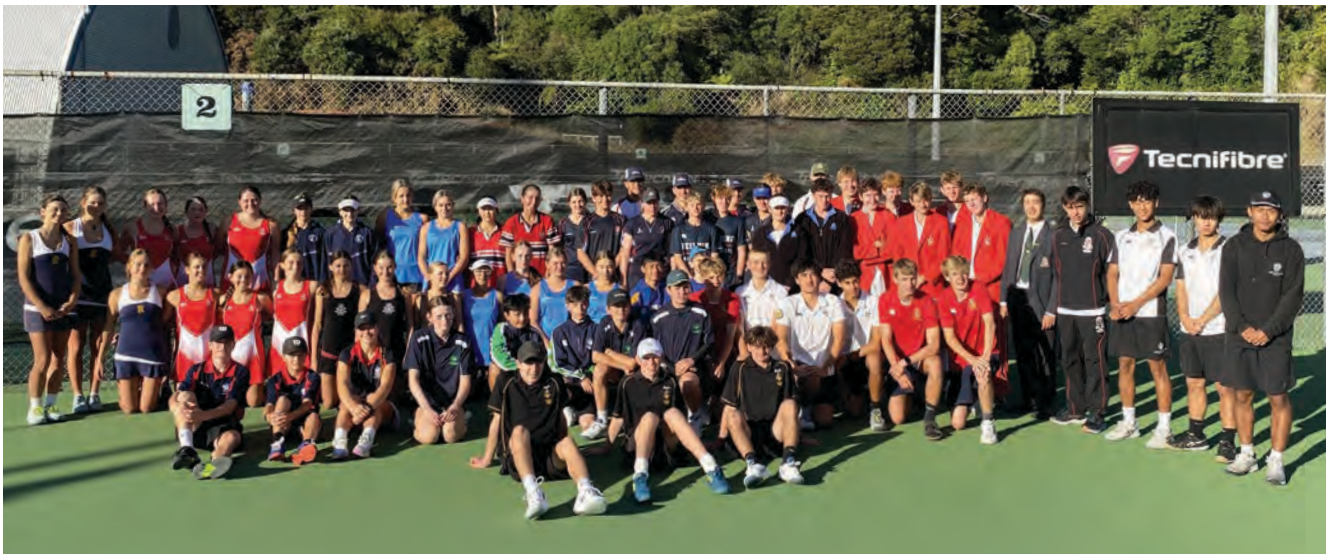
(Pictured): The New Zealand Secondary Schools' group.