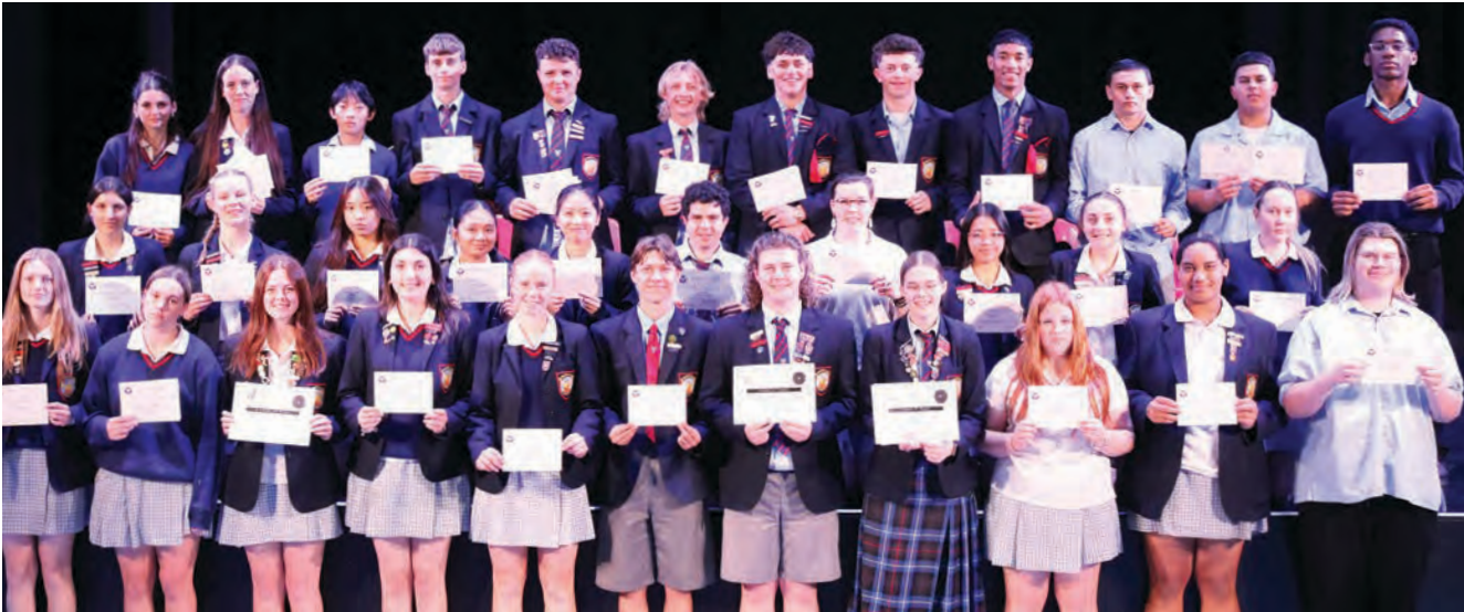
(Pictured above, Year 12 Principal's Commendation Awardees.