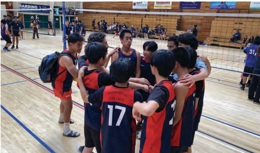
(Pictured): Boys volleyball team.