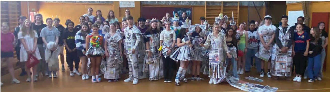
(Pictured): Peer Support leaders modelling their quality newspaper-made outfits, practised and ready to challenge their Year 9 groups to undertake the same exercise.