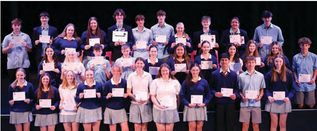
(Pictured, back row,Year 11 Principal's Commendation Awardees.