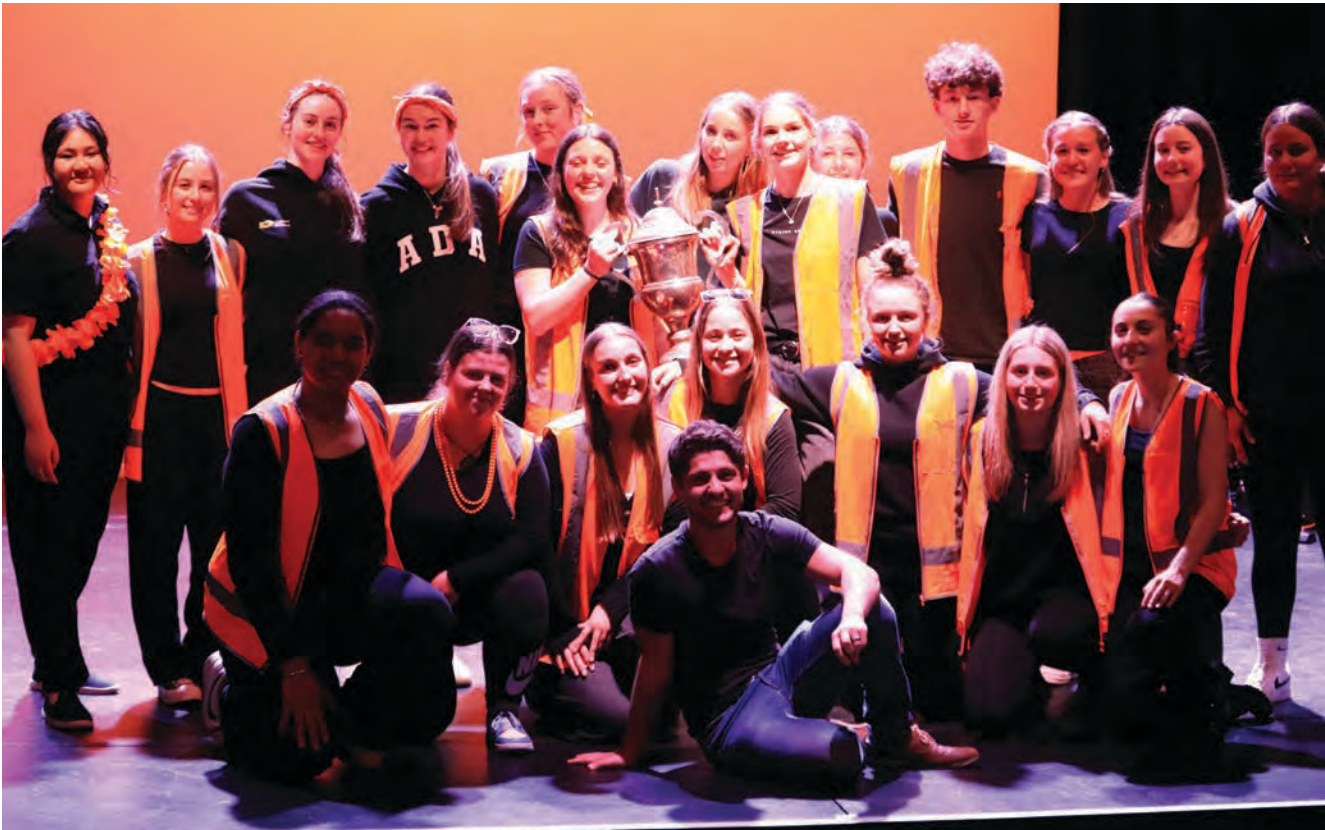
(Pictured): The jubilant Orange House performers, holding the trophy aloft.