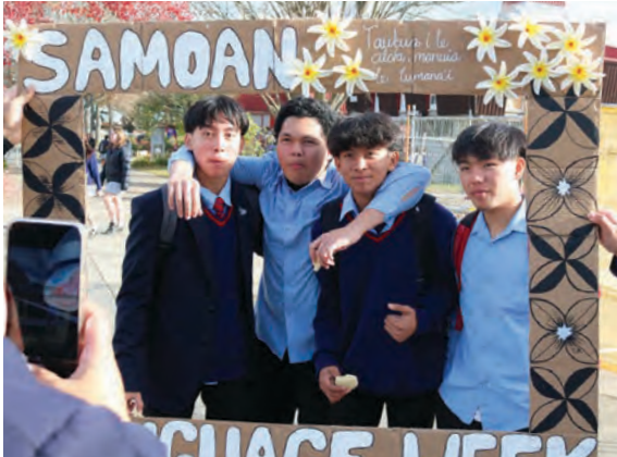
(Pictured): Samoa Islands Week.