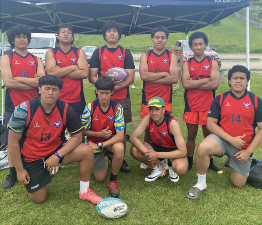
(Pictured): Our Touch team ready for a big day.

Girls' Knockout – wins over Timaru Girls' High School Yr 10, Waitaki Girls High School Black with a loss in the final to SKC 0-2.