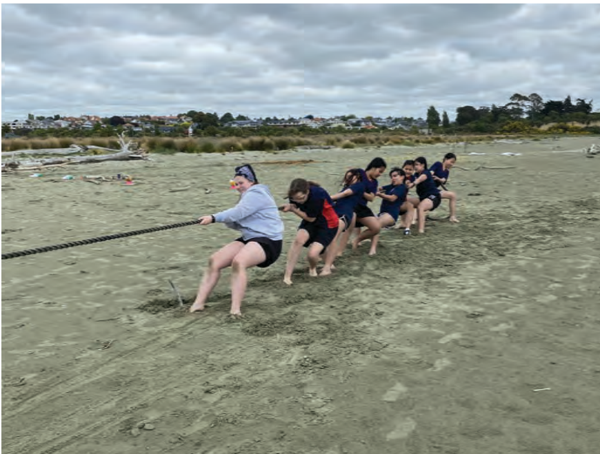
((Pictured): Tug O War at Caroline Bay – go AshColl!