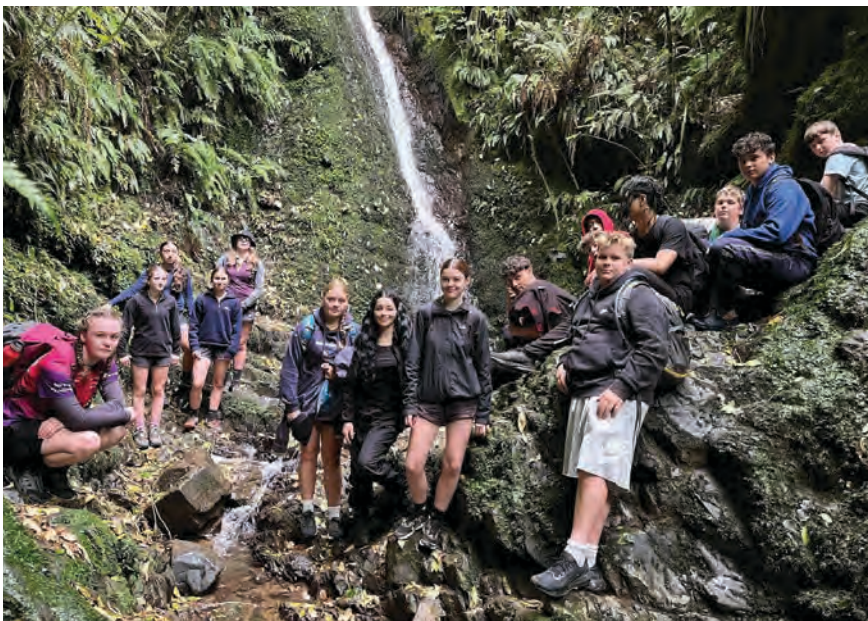
(Pictured right): A group on their way up Little Mount Peel.