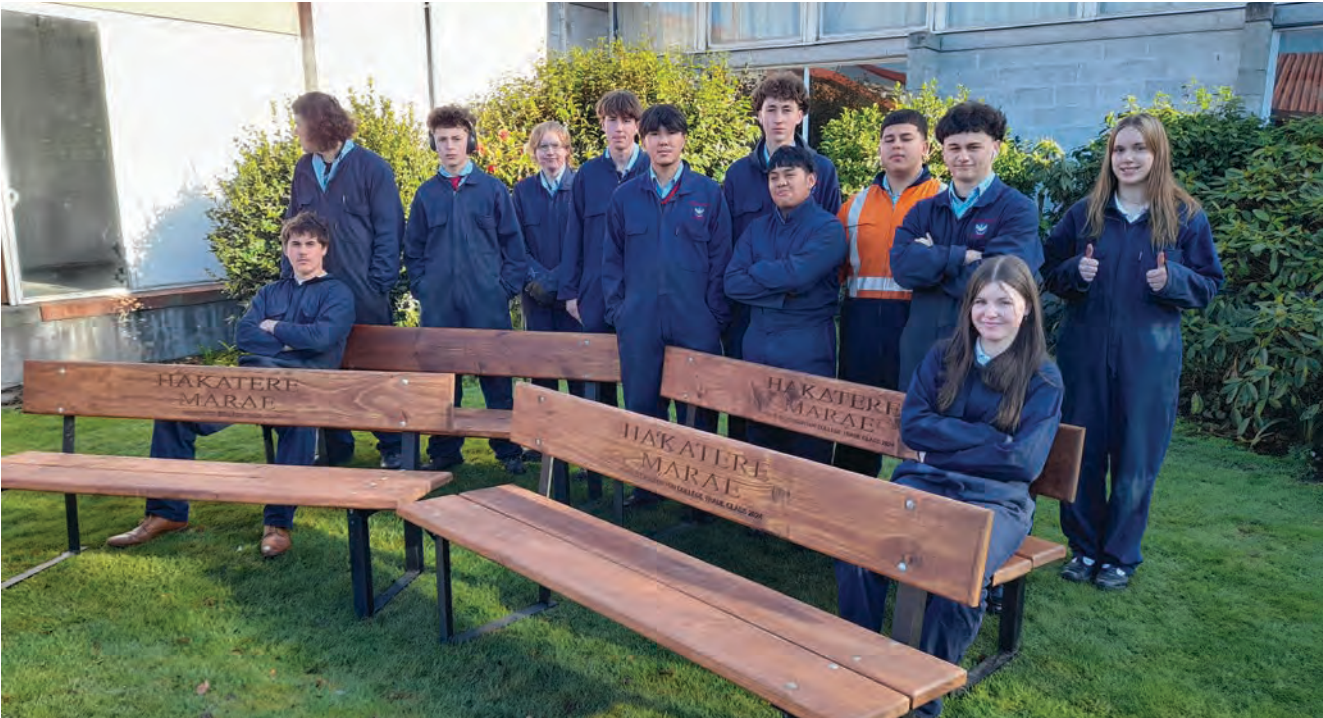
(Pictured): Ashcoll Trade students with the completed seating for Hakatere Marae. They look fantastic.