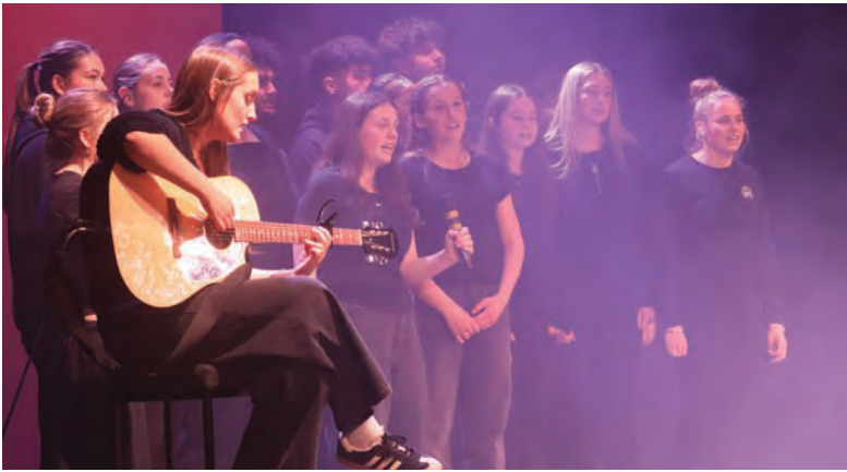
(Pictured): 'Ngā Manu o Te Whare Karaka' group, on their way to winning the vocal group category.