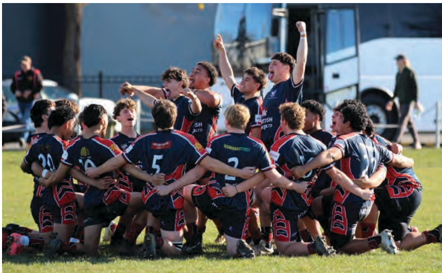
(Pictured): The team performing the haka before their match against Rangiora High School.

The next few games brought some season highlights for many of the players. Albeit a loss, the opportunity to play at Mount Hutt College in front of the school was exciting for many, and the closely-fought grudge match against Rangiora High School was game of the season, with each and every player stepping up across 70 minutes. Wins against Horomaka-Combined in a local night game, and Cashmere High School were enjoyable experiences for our boys. The boys finished the regular season with 4 wins, 1 draw, and 4 losses, eventually meeting Roncalli-Aoraki Combined in the plate semi-finals.