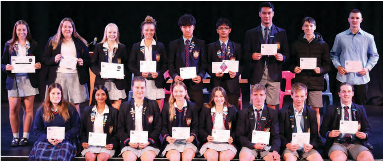
(Pictured above, Year 13 Principal's Commendation Awardees.