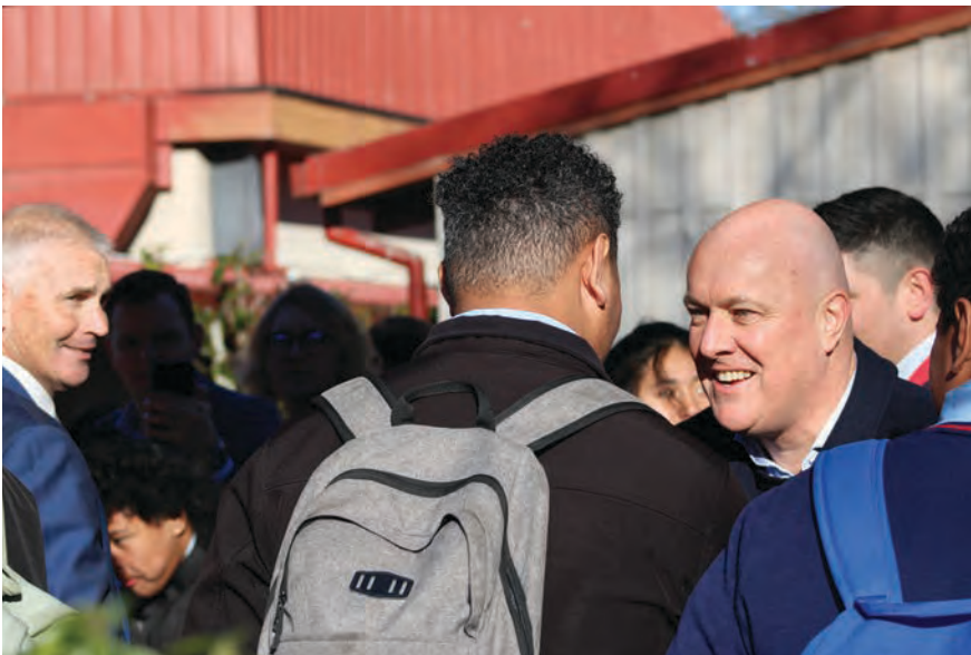
(Pictured): Christopher Luxon engaging with students en route to meeting with the senior student group.

This visit provided a rare opportunity to have the Prime Minister see directly the condition of our school environment, to talk with representative Management and Board personnel, and to gain a feel for our College visually and via communication with students.