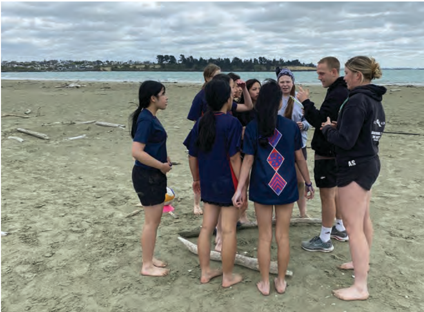
(Pictured): Team talk for Beach Volleyball.