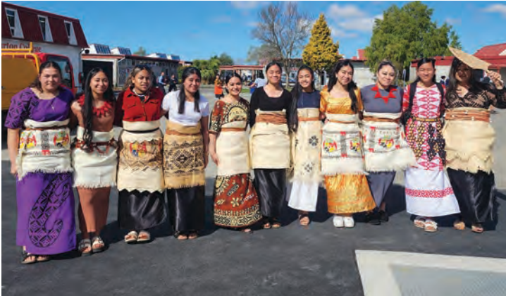
(Pictured): Students in cultural attire, with the Tongan flag centre stage.