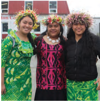
(Pictured): Cook Islands Week.