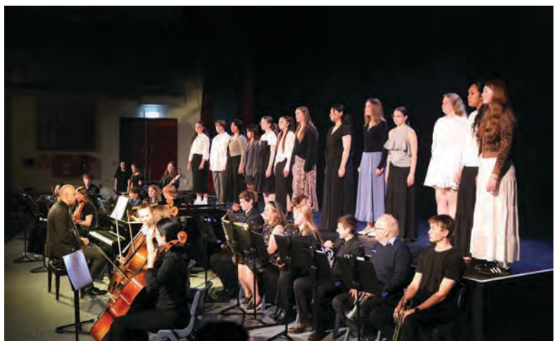
(Pictured): The orchestra and singers providing a fitting finale to the evening.