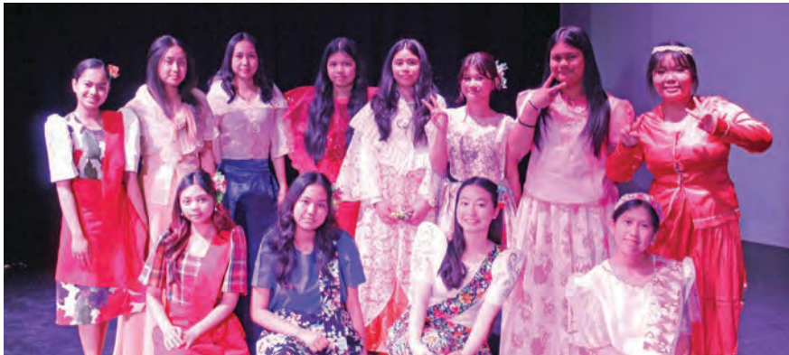
(Pictured): Filipino Week.