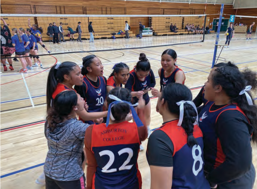
(Pictured): Girls volleyball team.

Outstanding results at the Aoraki Championships, with the boys securing 1st and 3rd and our AshColl girls 2nd! Our results show incredible student leadership and self-organisation. With such strong performances, the future of volleyball at AshColl looks very promising.