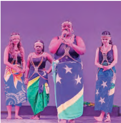
(Pictured): Soloman Islands Week.